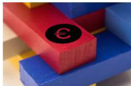
Finance and banking